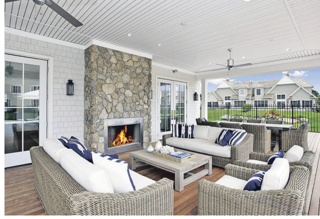
ALL FIRED UP: Indoor/outdoor living at Bishop's Pond in Southampton, where early buyers are already enjoying the summer weather.

with parking and concierge services. Buyers at Harbor's Edge which launches sales in early July also receive access to a rooftop sundeck, pool and wet bar.